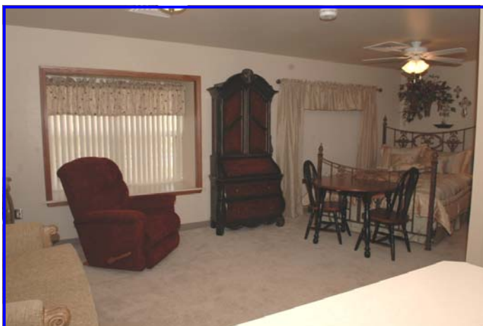
Spacious private rooms display same elegance as seen throughout the facility