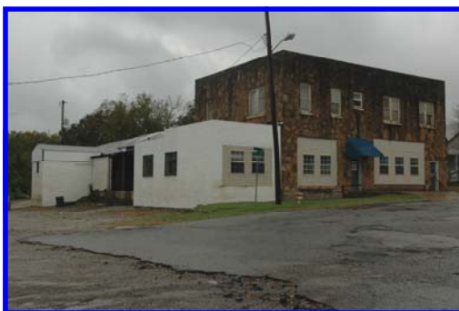
Dingy yellow lines mark the depth of the floodwater that entered the former home of Boat Floaters, LLC