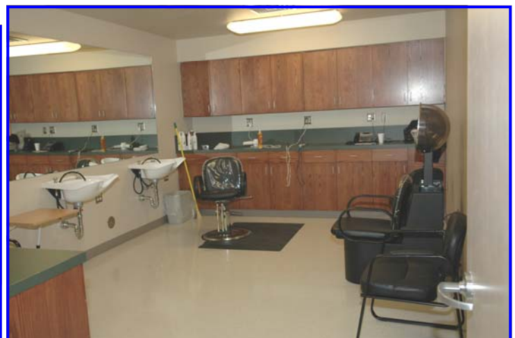
Residents of Providence Place also enjoy the benefit of a hair salon within the facility