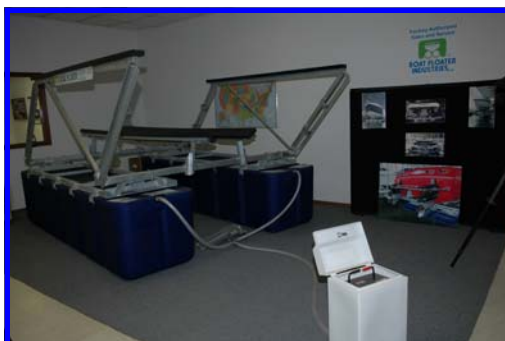
The new facility provides space to display a full-size boat lift which increases opportunities for marketing their product to potential customers.