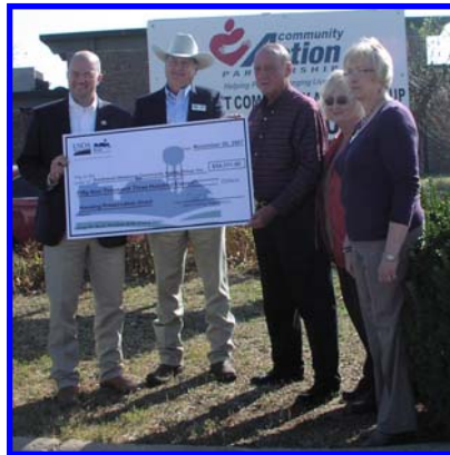
Right: Representatives from Southwest Oklahoma Community Action Group receive ceremonial check from USDA Rural Development

Freedom West Community Development Corporation received $108,600; Little Dixie Community Action Agency received $54,437; Southwest Oklahoma Community Action Group Inc. received $54,311.