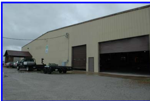
The 34,000 square feet facility is capable of accommodating the entire assembly-line manufacturing process