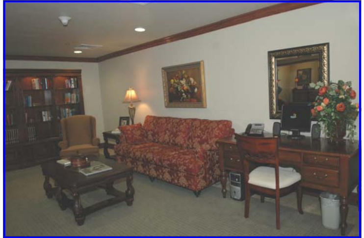
Common areas such as this library provide residents a cozy environment to visit with friends and relatives. Other common areas located throughout the facility offer LCD televisions for relaxing and catching a favorite show or sporting event.

Residents of Woodward, Oklahoma looking for a great place to meet their assisted living needs will not have to look any further than their rural home town. Thanks to the coordinated efforts of the Health Care Services Foundation and USDA Rural Development, a state-of-the-art, elegant facility is available in Woodward, Oklahoma. The 32-unit assisted living center offers twelve studio units, eighteen efficiency units, and two 2-bedroom units, along with many other conveniences and services typically found in a first-class facility. Although it is best to visit Woodward to experience the beauty and elegance of the project first hand, these pictures are provided for those who may not get to make the trip.