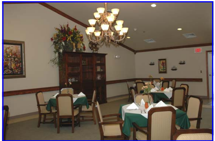
Beautiful chandeliers, flowers, and furnishings make the dining area a great place to enjoy the delicious meals prepared daily in the state of the art kitchen facility.

Residents of Woodward, Oklahoma looking for a great place to meet their assisted living needs will not have to look any further than their rural home town. Thanks to the coordinated efforts of the Health Care Services Foundation and USDA Rural Development, a state-of-the-art, elegant facility is available in Woodward, Oklahoma. The 32-unit assisted living center offers twelve studio units, eighteen efficiency units, and two 2-bedroom units, along with many other conveniences and services typically found in a first-class facility. Although it is best to visit Woodward to experience the beauty and elegance of the project first hand, these pictures are provided for those who may not get to make the trip.