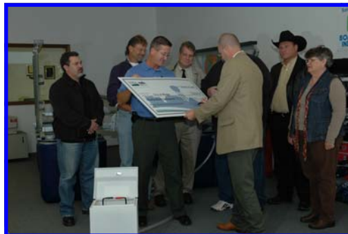
Officials from the City of Miami, Boat Floaters LLC, and USDA Rural Development celebrate the awarding of the $99,000 federal grant