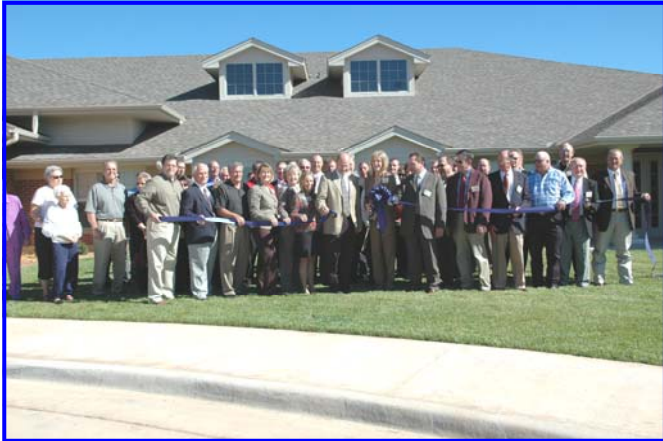
Health Care Service Foundation officially cuts the ribbon on Providence Place