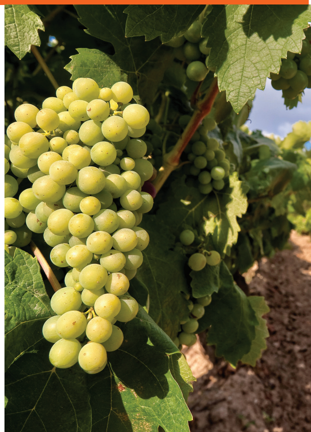
AGRICULTURAL SCIENCES AND NATURAL RESOURCES

NEW: Oklahoma Department of Agriculture, Food and Forestry's Continuing Education Units have been requested for categories 1A and 10 as well as private applicators.