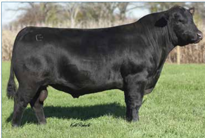
BALDRIDGE BRONC • Paternal Grandsire of lot 131