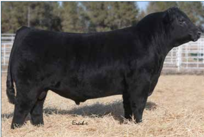
CAR DON ANNUITY 114 • Sire of lot 65