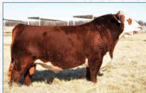
EXR BANKROLL 8130 ET • Sire of Lots 87, 89, 90 & 92