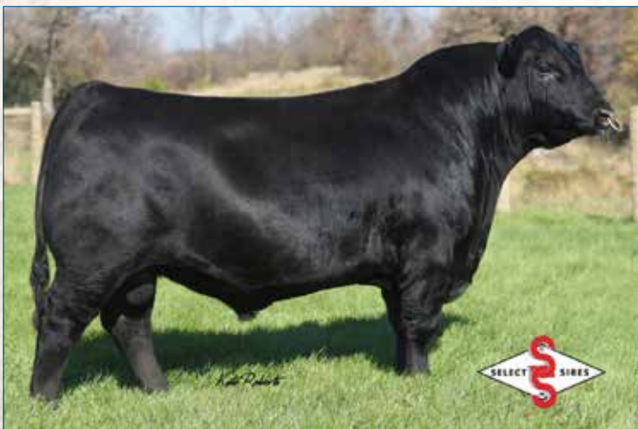
WERNER FLAT TOP 4136 • Sire of lot 66