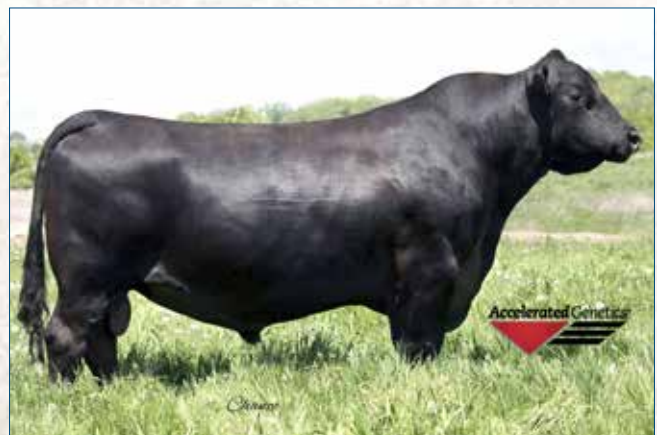
JINDRA ACCLAIM • Sire of lot 29