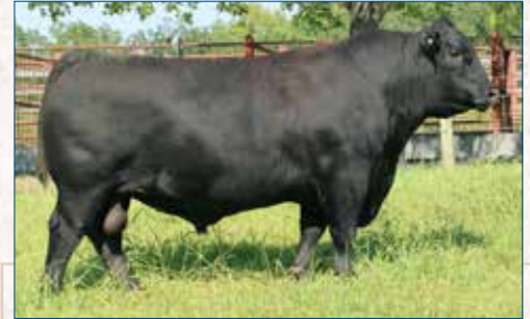
YON BOWERY F106 • Sire of lots 39 and 40