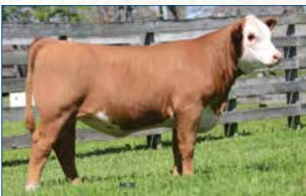
SFCC TRM ROSE 0195 ET $16,000 maternal sister to Lots 84-86