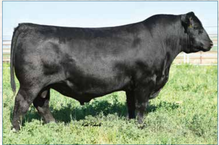
EXAR STOCK FUND 9097B • Sire of lots 36 thru 38