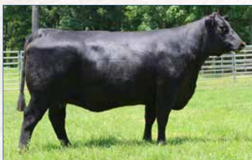
BOBO RITA 5046 • Dam of lot 7