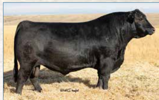
EXAR GRENADE 9152B • Sire of lots 30 thru 35