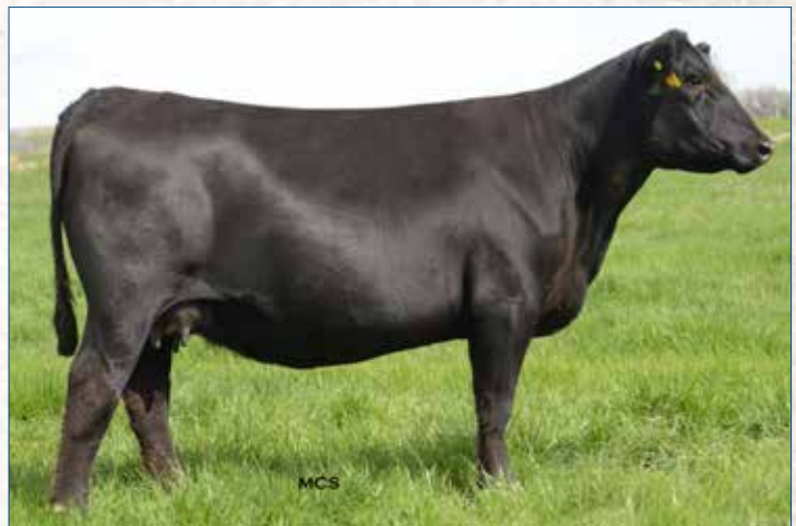
SHAW LADY RESERVE 623 • Dam of lot 13