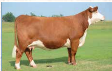
SFCC MOIRAI 1921 ET Dam of Lot 95