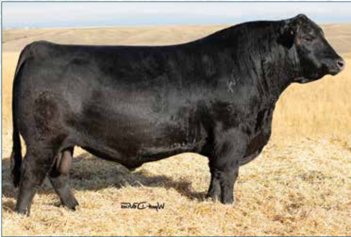
EXAR GRENADE 9152B • Sire of lots 30 thru 35