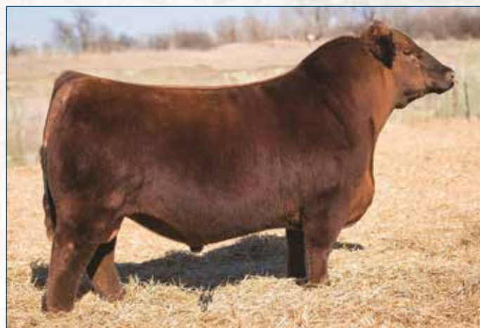
MF POKER FACE 7862 • Sire of Lot 114