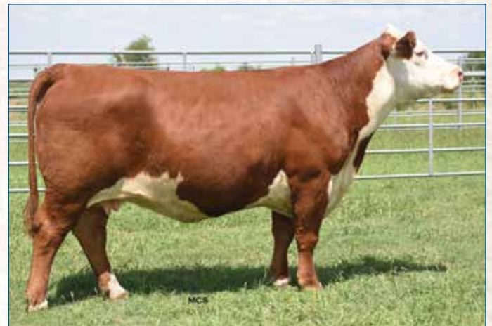
MCS A7 2Z SANDY 1709 ET • Dam of Lot 106