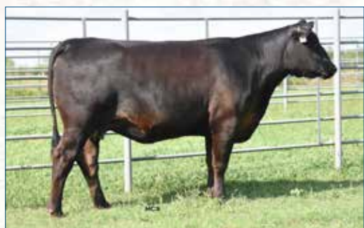
WF MISS FAELYNN 0603 • Dam of lot 31