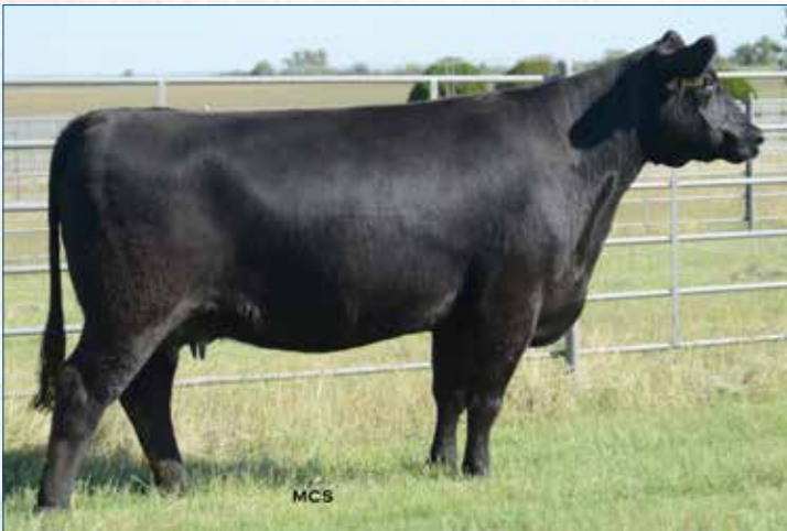
SMR DVF HENRIETTA 3114 • Dam of lot 58