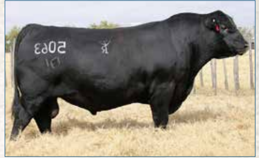
BAR R JET BLACK 5063 • Sire of lot 126, Grandsire of lots 116 thru 125