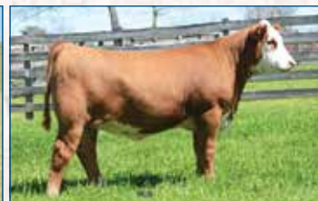
SFCC TRM ROSE 0186 ET $20,000 maternal sister to Lots 84-86