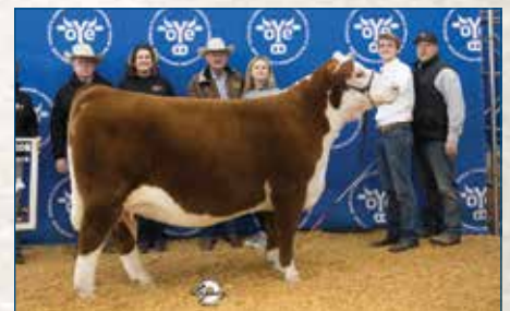
MCKY DESTINY 6458 ET Maternal grandam of Lot 95