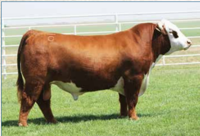
BR BELLE AIR 6011 • Sire of Lot 102