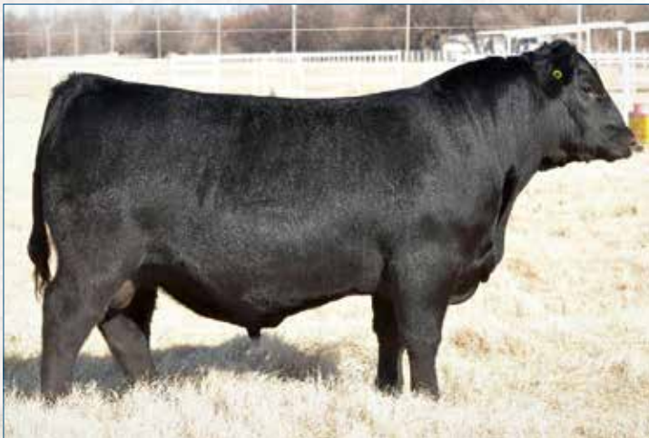
EXAR JET SPEED 9334B • Sire of lots 116 thru 125