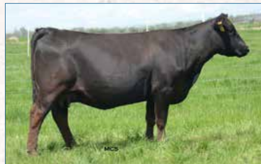
SHAW LADY COMRADE 785 • Dam of lot 6