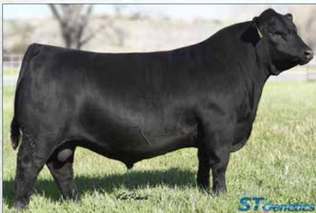
S A V RAINDANCE 6848 • Sire of lot 28