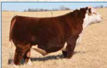
KLD RW MARKSMAN D87 ET Sire of Lot 84