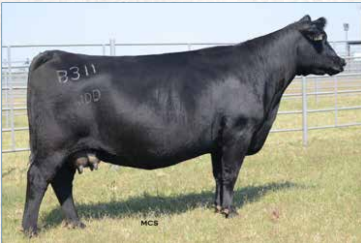
JDD BESS B311 • Dam of lot 32 and 33

• Lots 32 and 33 are sons of the outstanding TRM and Wheeler donor, Bess B311, and maternal brothers to the $15,500 top-selling selection of Pollard Farms from the 2022 Wheeler, SFCC, and MCS Joint Production Sale sired by Grenade, who was the anchor bull of the 2020 National Western Grand Champion Carload of Angus Bulls.