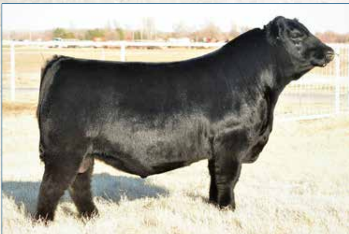
EXAR MIGHTY 9090B • Sire of lots 73 and 74