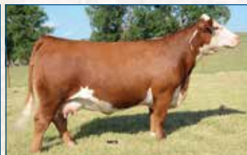
SFCC PF KNOCKOUT ROSE B418 Dam of Lot 84