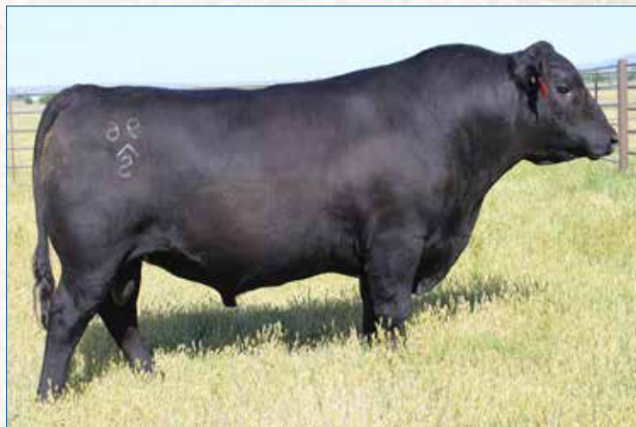
S/F STUNNER 96 • Sire of lots 133 thru 138