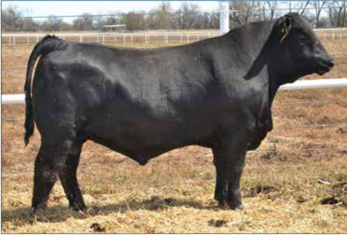
EXAR JET BLACK 9755B • Sire of lots 57 thru 60