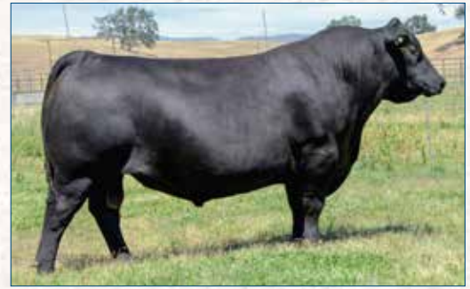
E&B PLUS ONE • Sire of lot 10