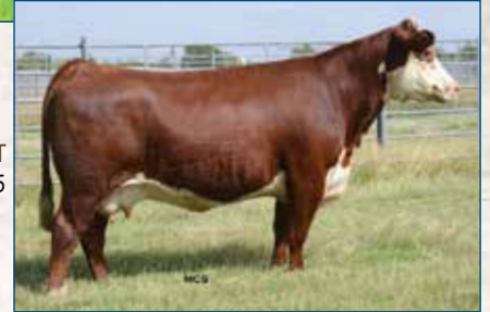
WF MISS VELVET C209 ET Dam of Lot 105