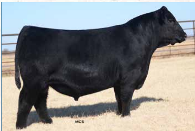
POLLARD CONTENDER 0402 • Sire of lots 41 and 42