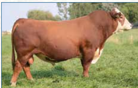
/S MANDATE 66589 ET Sire of Lot 95