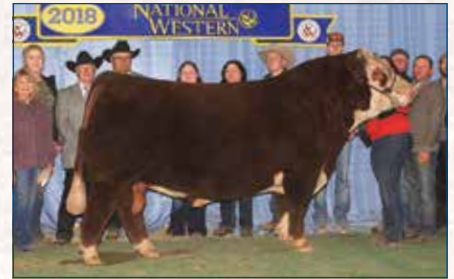
KLD EB TRUMP D58 • Sire of Lots 90, 93, 94, 96 & 97