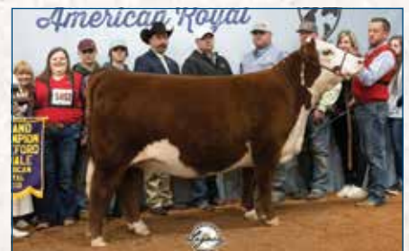
KLD RW MADELEINE D82 ET • Donor dam of Lots 93 & 94