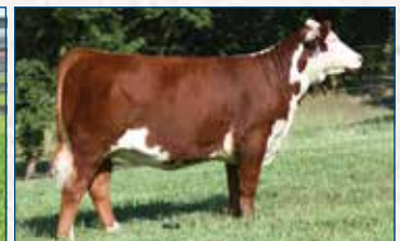
SFCC SWEET ROSE 2100 ET $12,000 flush sister to Lots 84-86