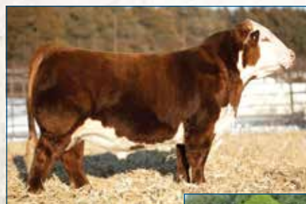
H THE PROFIT 8426 ET Sire of Lot 104