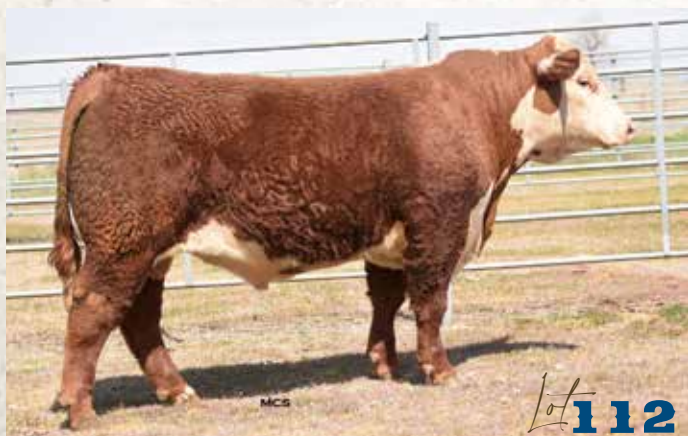
NJW 84B 4040 FORTIFIED 238F • Sire of Lot 111