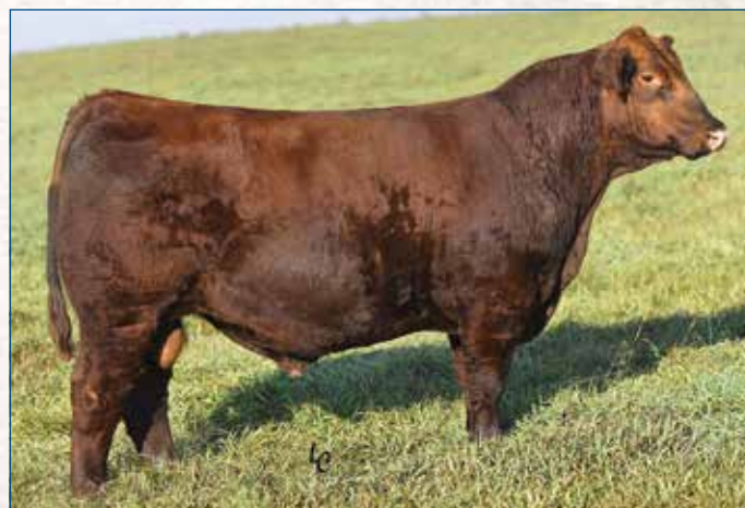
BIEBER DEEP END B597 • Sire of Lot 115