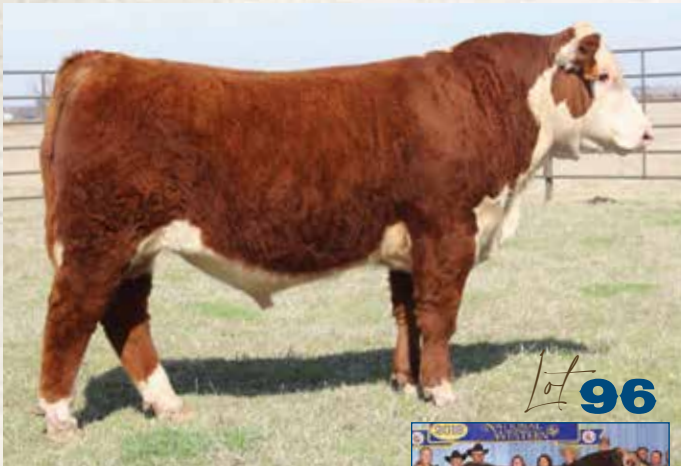
KLD EB TRUMP D58 Sire of Lots 90, 93, 94, 96 & 97