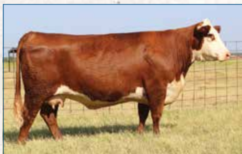
TH 60W 17Y RUBY 404B ET • Donor dam of Lots 87-92