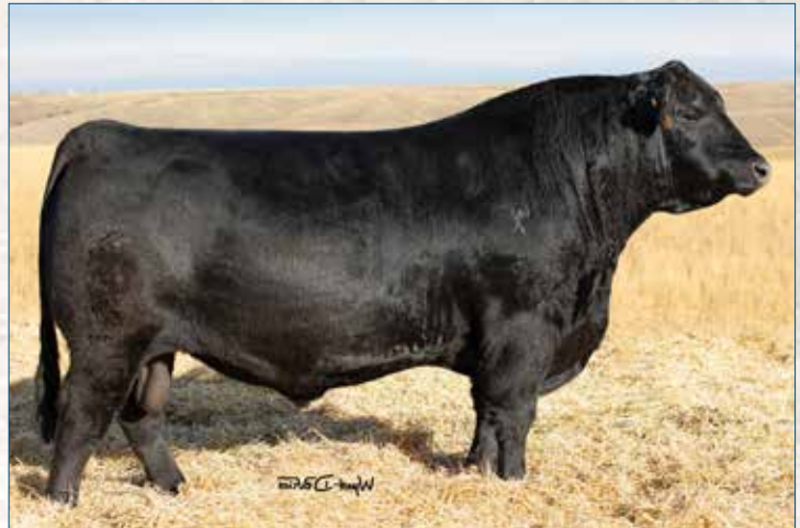
EXAR GRENADE 9152B • Sire of lots 11 thru 14