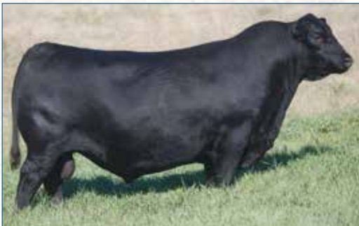
S A V RENOVATION 6822 • Sire of lot 127