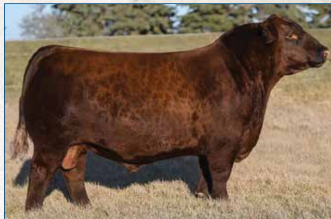
KJHT POWER TAKEOFF • Sire of Lot 113