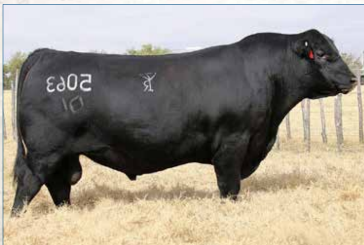
EXAR JET BLACK 9755B • Sire of lot 16