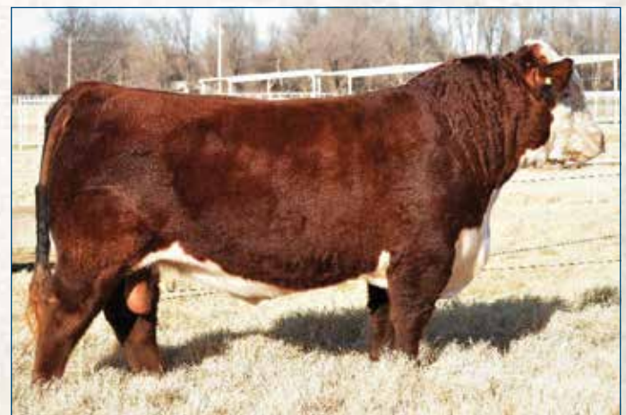
EXR AIR EXPRESS 8135 ET • Sire of Lots 99-101