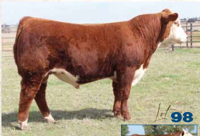
MCS 11X LADY IN RED 8012 ET Dam of Lot 98