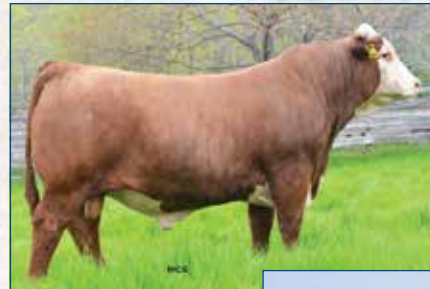
/S TRM MANDATORY 88573 ET Sire of Lot 105