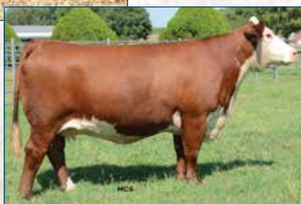
PEZ MISS REVOLUTION 421 Dam of Lot 104