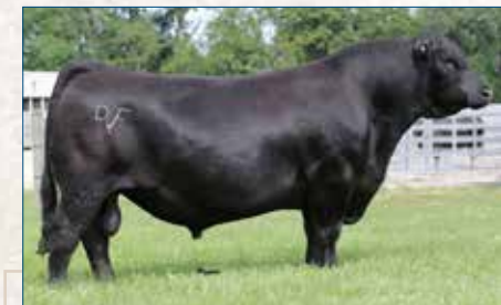
DEER VALLEY GROWTH FUND • Sire of lots 1 thru 5