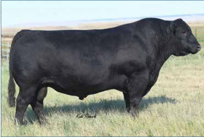
SYDGEN ENHANCE • Sire of lots 63 and 64