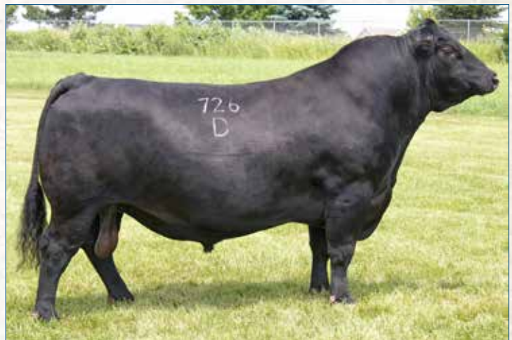
SITZ STELLAR 726D • Sire of lot 19