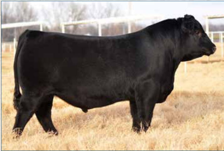
EXAR GURU 8719B • Sire of lot 43