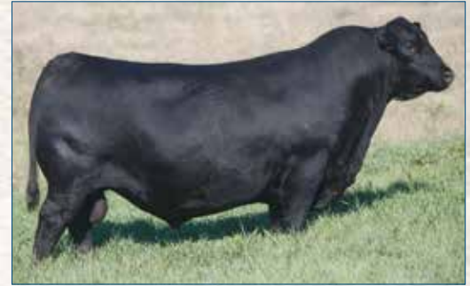
SA V RENOVATION 6822 • Sire of lots 61 and 62