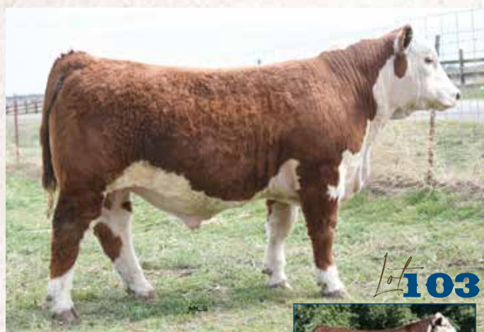
SR TKC 2018 CATAPULT 7081 ET Sire of Lot 103