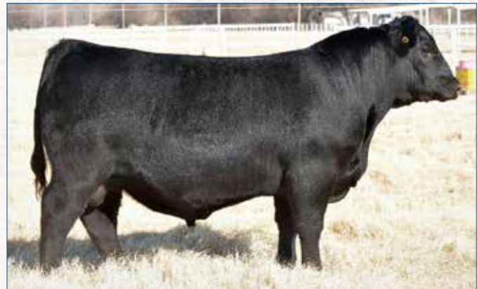
EXAR JET SPEED 9334B • Sire of lots 46 thru 56