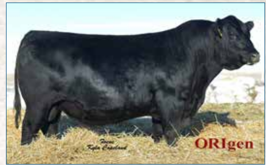
BASIN PAYWEIGHT 1682 - SIRE OF LOTS 7 THRU 9