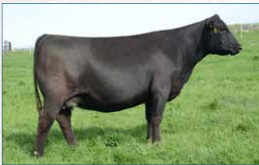
SHAW LADY RESERVE 6026 • Dam of lot 11