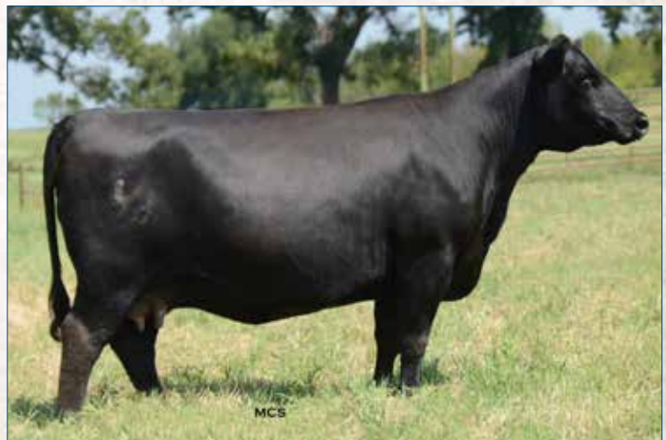
BLACKJACKS BLACKBIRD 620 • Dam of lot 14