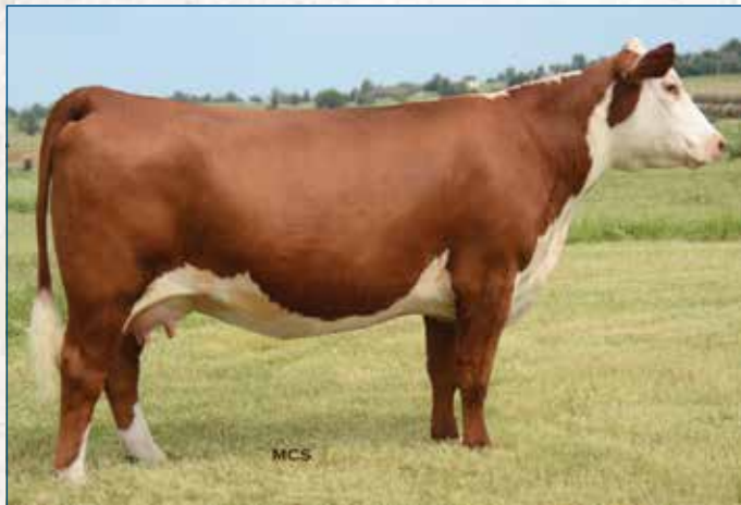
MCS U14 ROMATE 705B • Donor dam of Lots 96 & 97